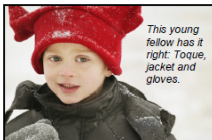
This young fellow has it right: Toque, jacket and gloves.