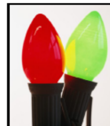
One thing to remember about Christmas lights: Indoor-specific lights for indoors; outdoor lights for outdoors.

Remember to take the time to CELEBRATE and have a joyful holiday season!